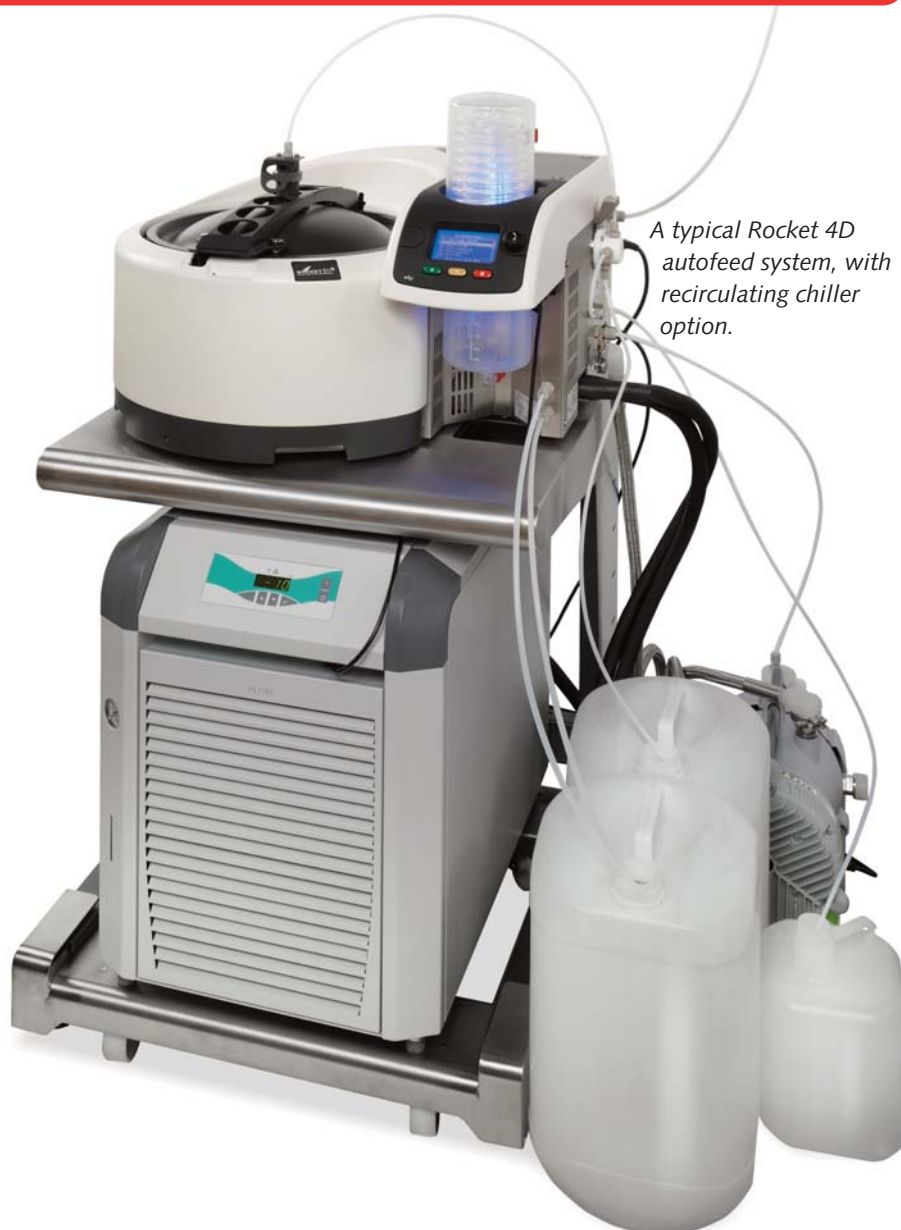
A typical Rocket 4D autofeed system, with recirculating chiller option.

Cleaning the Rocket 4D between cycles is very straightforward. The PTFE feed tubing is easily detached for cleaning or replacement and the vessel can be readily cleaned, wiped, inspected and even put in a dishwasher. It's all so easy compared with handling large glass evaporator flasks!