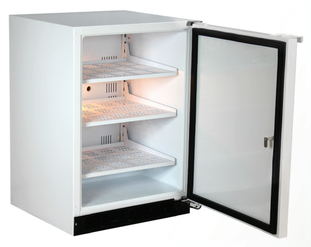
6CARFX Solid Door with Lock