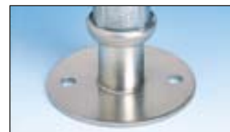
3 1/2" (89mm) Foot Plate