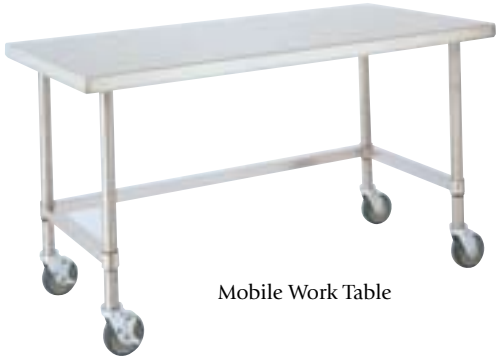
Mobile Work Table