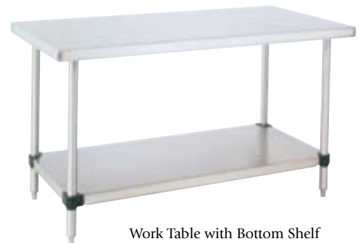
Work Table with Bottom Shelf