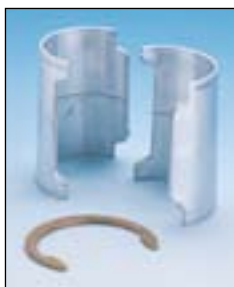
Replacement HD Super™ Aluminum Split Sleeve