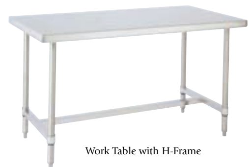
Work Table with H-Frame