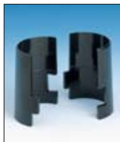
Replacement HD Super™ Plastic Split Sleeve