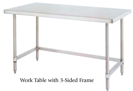
Work Table with 3-Sided Frame