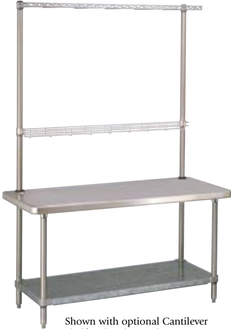
Shown with optional Cantilever Shelf and Utility Rack

All overhead models are fitted with stationary posts and leveling feet. For overhead models in other sizes, contact your InterMetro representative. SS = Stainless Steel