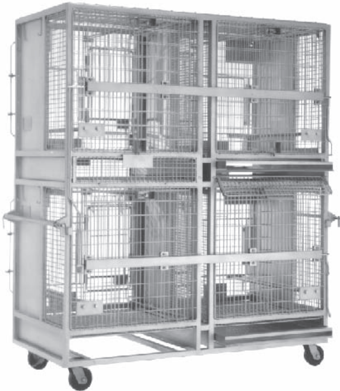
109578 Social Environment Primate Cage (Back view)

left side has Flush-through Pans removed