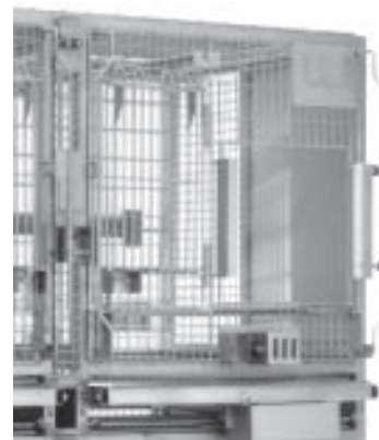
Opening for Removable Social Enrichment Panel