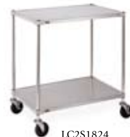
LC2S1824 (casters ordered separately)

Note: To build a lab cart according to specific requirements, follow instructions (D) on previous page. Refer to Autoclave guidelines, below, for important checklist to follow.