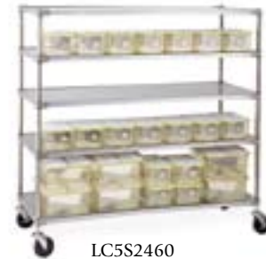
LC5S2460 (casters ordered separately)

Note: To build a cage rack according to specific requirements, follow instructions (D) on previous page. Refer to Autoclave guidelines, below, for important checklist to follow.