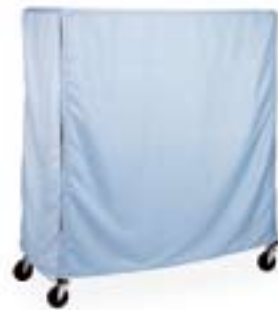
LC5S2460 with autoclave cart cover (casters ordered separately)

Note: Autoclave cart covers are rated for approximately 70 cycles per cover.