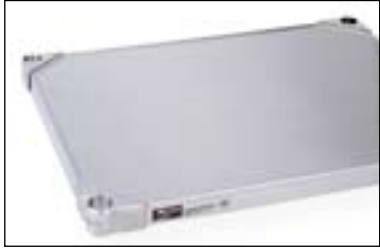
All stainless solid shelf with stainless corners