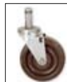
5MHTP & 5MHTPB

Note: Casters are temperature rated for up to 300°F (149°C)