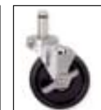
5MHTN & 5MHTNB