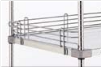
4" (101mm) Ledges

*Actual ledge length is approximately 1" (25mm) shorter than nominal shelf length/width.