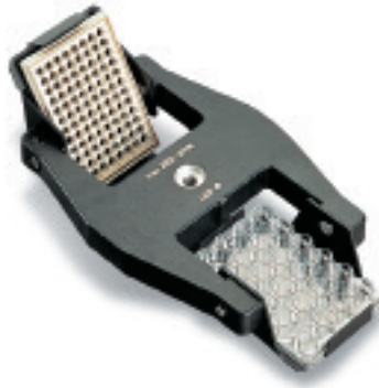
Microplate rotor 75008177