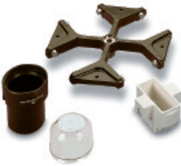
Swinging bucket rotor 75008179 with round bucket 75008172 (left), aerosol-tight cap 75008173 (middle) and cyto bucket 75008176 (right)