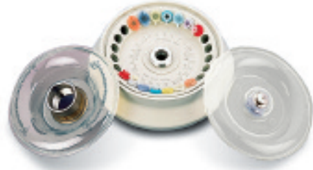
Fixed angle rotor for microliter tubes 75003325