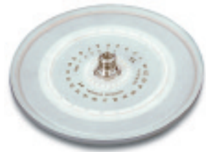
Haematocrit rotor 75008171 1)