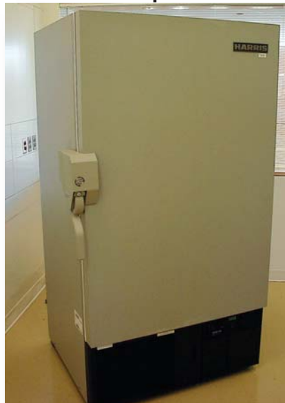
Low Temp Freezer