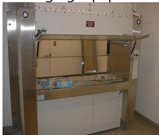
Animal Handling and Cage Changing Equipment