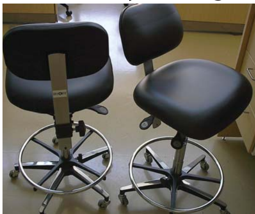
Ergonomic Laboratory Seating