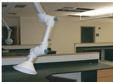
Point of Use Exhaust