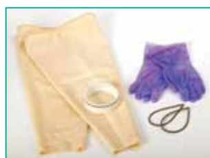
Replacement Glove Kit