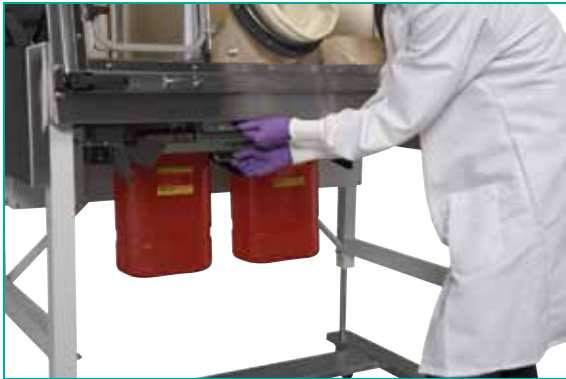
Step 1. Release locking mechanism by pulling handle.

When the container lid has been sealed, follow these three steps to change containers: