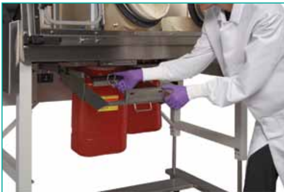
Step 2. Pull down and out container tray. Remove container block.