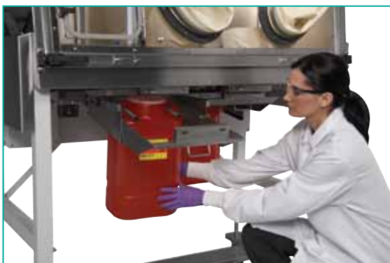
Step 3. Remove container from guides and replace.