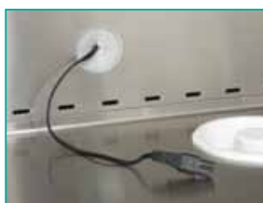
Data / Power Cord Pass-Through