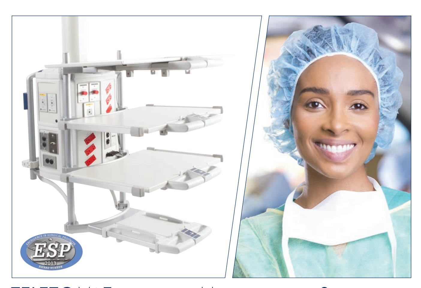
TELETOM® Equipment Management System