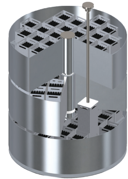
Multi-tiered straw storage systems for V1500 & V3000

Our 2301 controller is time tested, reliable and designed to keep your sample storage safe and secure.