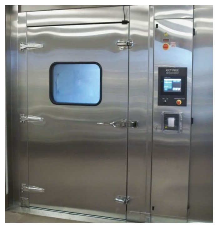
VT 2850 washer.