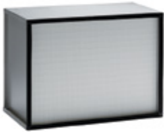
Metal Frame HEPA Filter

The life of a HEPA filter for a Biological Safety Cabinet (BSC) is an important subject when considering the life cycle cost of any BSC. HEPA filter loading capacity has always been a major concern for the design and performance of a BSC. Not only in terms of replacement cost, but also laboratory safety through the replacement process, down time, and associated costs.