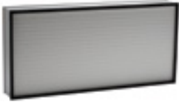
Metal Frame HEPA Filter

HEPA Filters (99.99%) retain or trap only particulates. [To learn more, see NuAire Technical Bulletin entitled "Use of HEPA Filters in Biological Safety Cabinets"]