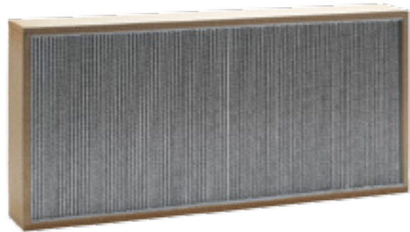
Wood Frame HEPA Filter

Since actual filter loading in the field is based upon the laboratory environment the BSC is used in, actual life of the HEPA filters will vary for each installation. If the BSC was installed in a clean room, theoretically the filters will last forever. If the BSC was installed in an environment that has or generates a lot of particulates, the filters won't last as long. To establish average filter life in a standard life science laboratory, historical data was reviewed as to when replacement HEPA filters were ordered. Based on NuAire data and knowing our AC PSC motor design provides a 180% increase in pressure drop, it was found that filters were lasting an average of 7 years.