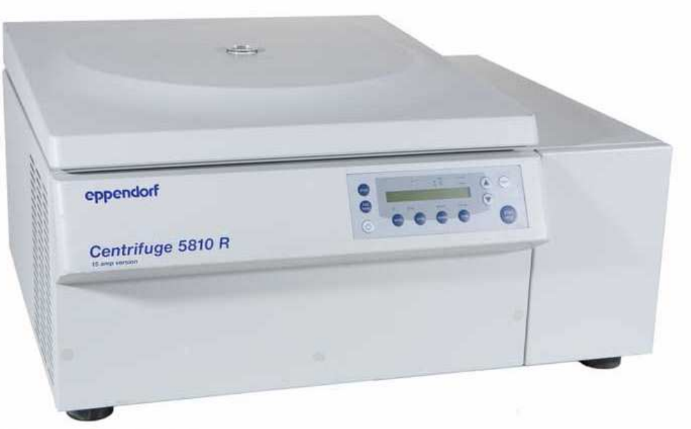
Best Products. | Best Performance. | Best Protection.