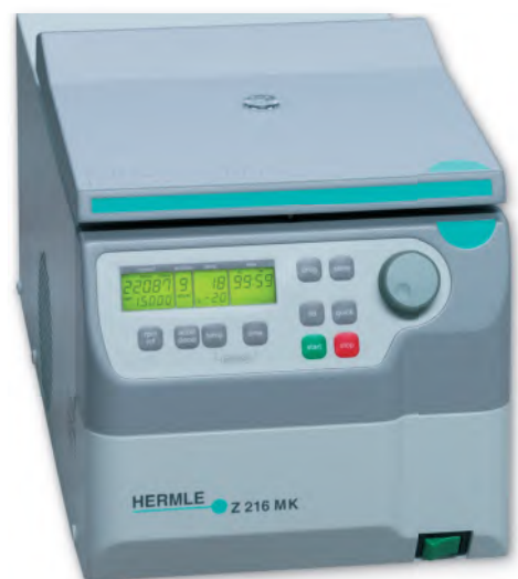
Universal Centrifuge Z216-MK Max. speed 15,000 rpm Max. volume 44 x 1.5 / 2.0 ml

■ For more Information, please visit our website!