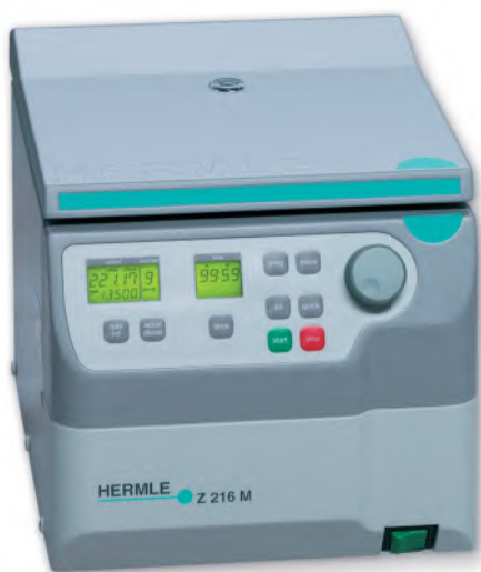
Universal Centrifuge Z216 -M Max. speed 15,000 rpm Max. volume 44 x 1.5 / 2.0 ml