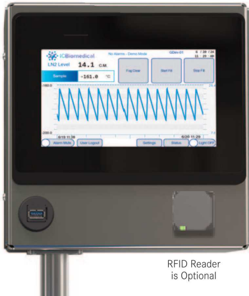
RFID Reader is Optional