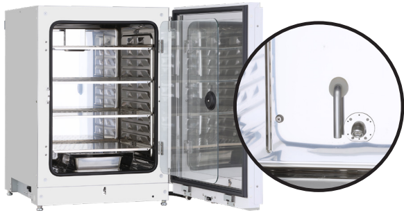
Model MCO-173AICUV-PA shown above and a closer look inside.