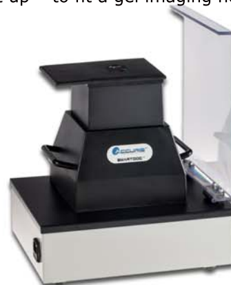
Accuris™ UV transilluminator shown with optional SmartDoc™ enclosure for smart phone imaging

Ethidium Bromide SmartGlow™ LD and PS Gel Red™ Gel Green™ SYBR® Green SYBR® Safe Diamond™ Nucleic Acid Dye