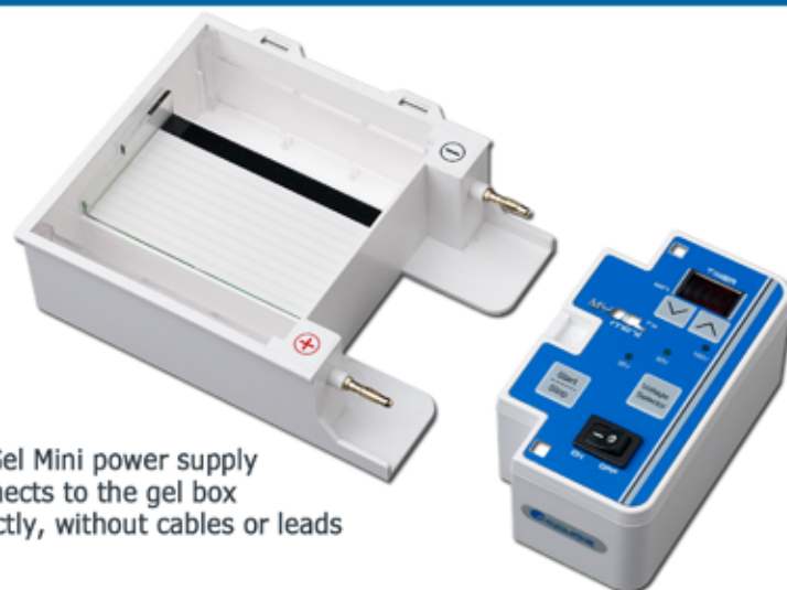
myGel Mini power supply connects to the gel box directly, without cables or leads