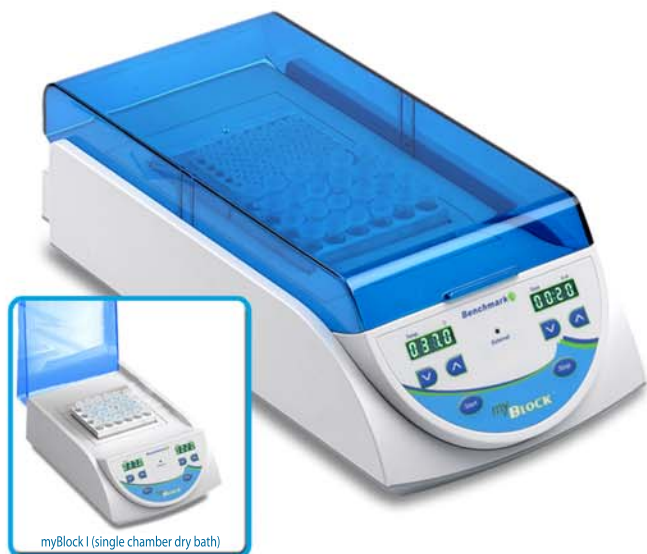
myBlock I (single chamber dry bath)

Benchmark's myBlock series is a "next generation" product line that introduces several major advantages over traditional dry baths. They are the first digital dry baths to include advanced microprocessor controls, timed or continuous operation and a removable hinged lid. In addition, an optional external temperature feedback probe can be positioned directly inside a sample tube, providing real-time control and monitoring of actual sample temperature .