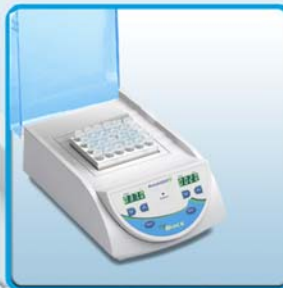
myBLOCK I Single Block Capacity