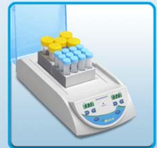
myBLOCK II Dual Block Capacity