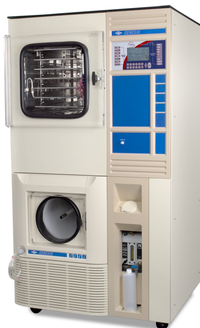
(Standard configuration Genesis 35L shown)