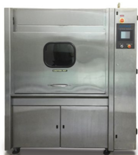
Drawings display front and side of VT 773 washer.