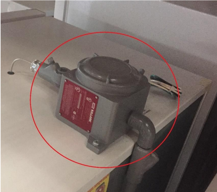
Mechanical Temperature Controller – located in the rear top location of refrigerator or freezer, inside of the metal enclosure.

After making an adjustment, please allow 8 hours' operation before making a new adjustment.