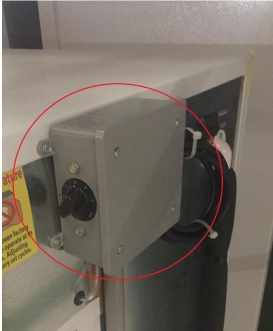
Mechanical Temperature Controller – located in the rear top location of refrigerator or freezer.

After making an adjustment, please allow 8 hours' operation before making a new adjustment.