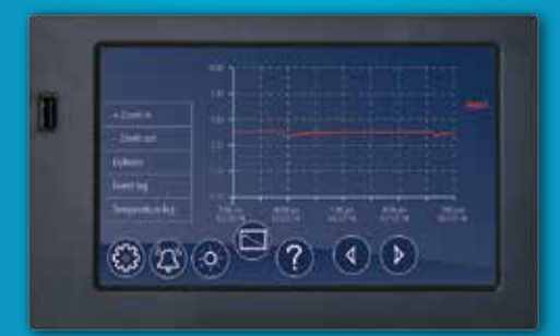
Constant temperature monitoring