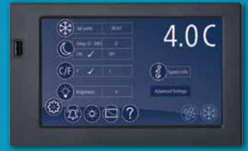
Quick access to control settings

Optional 7" full-color capacitive LCD touchscreen provides direct access and control to key settings