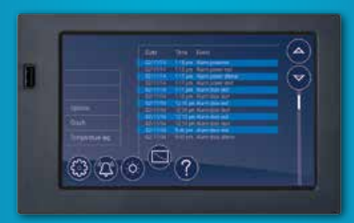
Event and data logging with easy downloading via convenient USB port