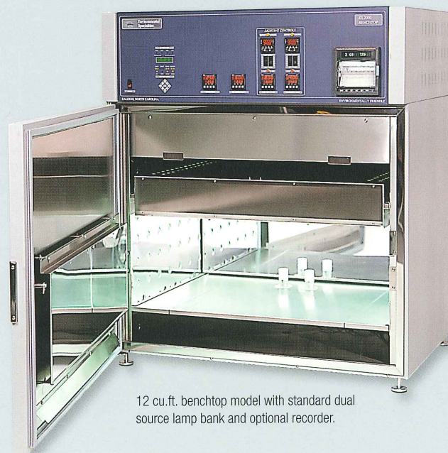
12 cu.ft. benchtop model with standard dual source lamp bank and optional recorder.

BES performs standard calibrations/mapping and maintains all documentation of the lighting systems prior to shipment. You can feel confident in knowing that your lighting system is calibrated with NIST-traceable instrumentation and that the lighting uniformity is verified with our multistep 20 point mapping procedure.