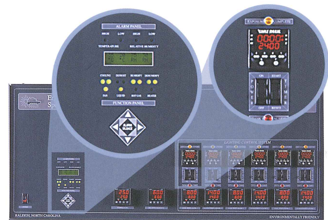
Control panel shown with temperature and humidity control and optional three dual source light bank controls (6 total light systems).