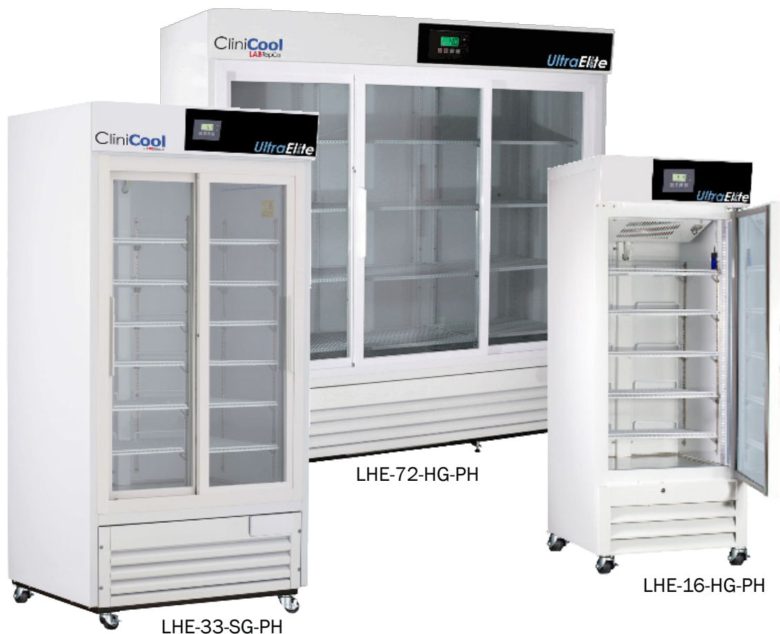
Standard Digital Temp Display & Alarm Module

Specifications subject to change without notice.