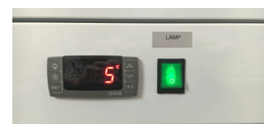
Digital Temp Display/ Microprocessor Temp Controller