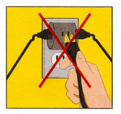
<u>Never</u> plug in more than one unit per electrical outlet.

The supply circuit to this cabinet must conform to all National and Local Electrical Codes. Consult the cabinet Serial-Data plate for voltage, cycle, phase, and amp requirements before making connection. VOLTAGE SHOULD NOT VARY MORE THAN 5% FROM