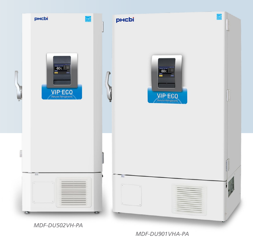
| 2 |