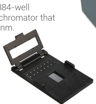
SmartDrop™ Accessory Plate