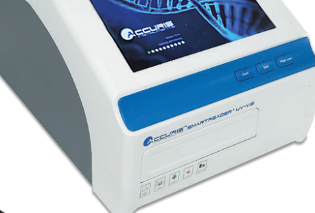
* Use part number "-E" to indicate 230V input and specify required plug type