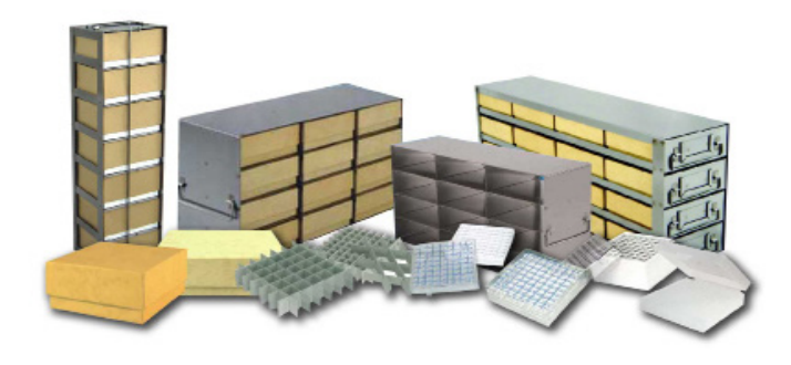
Maximize Freezer Space Please visit labrepco.com or speak with your local representative for inventory rack information.