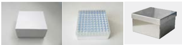
White 2" Cardboard Box