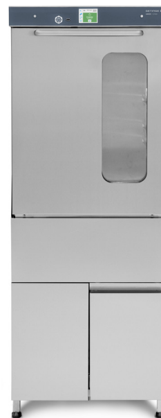
Getinge Lancer model 1300 LX labware washer; shown with optional View-In-Process (VIP) window.