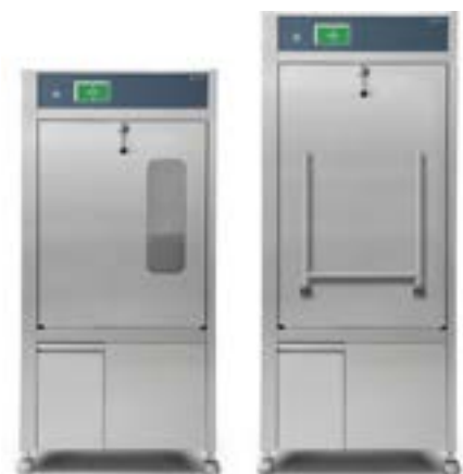
Getinge Lancer model 1600 LXP and 1600 LXP with height extension. View-in-process is optional.