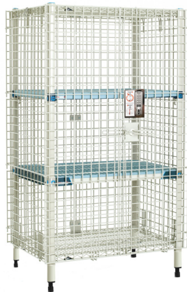
MetroMax Q (Stationary) with optional Intermediate shelves.