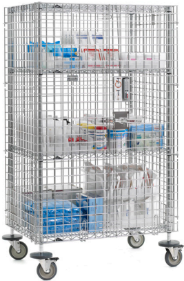
Super Erecta Shelf (Mobile) with optional Intermediate shelves.