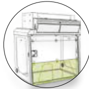
Air Face Velocity