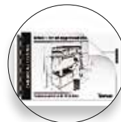
Documentation Chemical listing