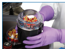
NU-L625 4 x 625 ml Airtight Lids (Qty 4)