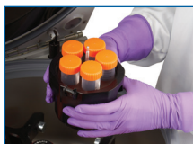
NU-B625 4 x 625 ml Swing Out Buckets (Qty 4)