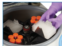
NU-BXDW Microplate Carrier (Qty 2)