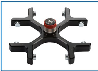
Part #: NU-RX625 4 x 625 ml Swing Out Rotor