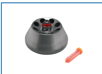
Part #: NU-RA8-50 8 x 50 ml 25° Angular Rotor