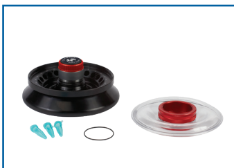
Part #: NU-RA24-2 24 x 1.5 / 2 ml 45° Angular Rotor with Airtight Lid