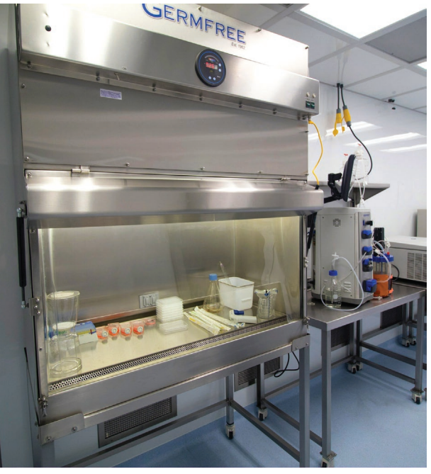
Class II, Type A2 Biological Safety Cabinet inside the Laboratory

Our mobile containment laboratories are designed by a team of biocontainment experts to provide the optimal safety for the handling of biologically contaminated materials. This allows the facility to be effectively utilized for manipulating samples required to be handled in a containment laboratory environment.