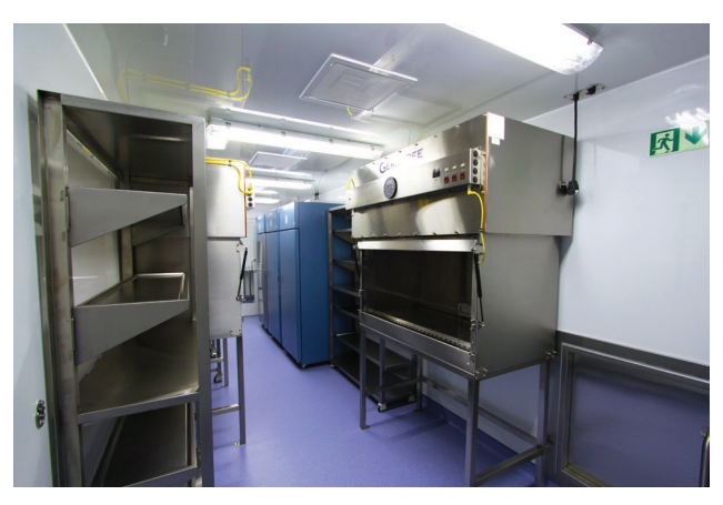
Class II, Type A2 Biological Safety Cabinet inside the Laboratory

Our WHO BSL-3 Laboratory Buildings are designed by a team of biocontainment experts to provide the optimal