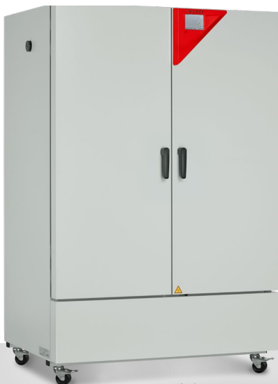
Model KBF 720