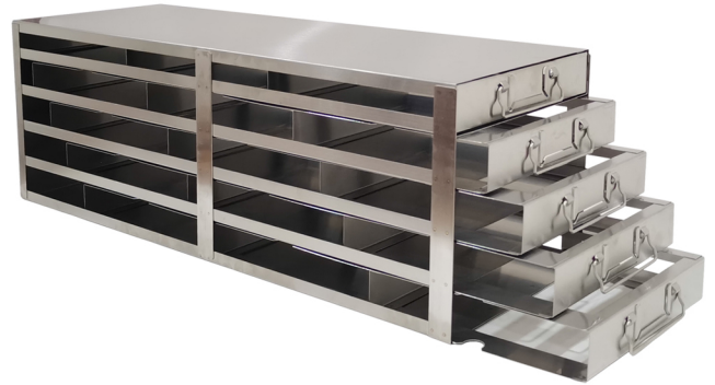
UFD-252-T2 Stores (10) Pfizer Covid-19 Vaccine Boxes