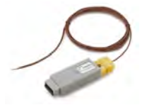
Single or Dual K-Thermocouple Temperature Sensor

Select the sensor that's right for your application: