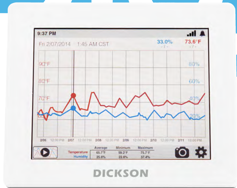
DicksonOne TWP Touchscreen with POE Dimensions: 8.5 x 1.75 x 7" | Display Dimensions: 8" Diagonal Display Type: LCD Touchscreen