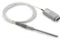
Platinum RTD Temperature Sensor