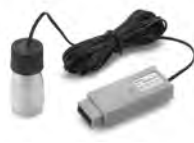
Single or Dual Temperature Thermistor Sensor with buffer solution