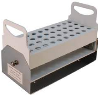
Adjustable Tube Racks