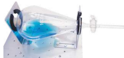
Separate Funnel Fixture