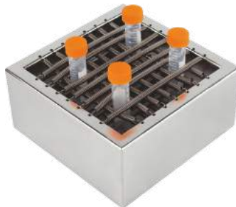
Mini Universal Spring Platform