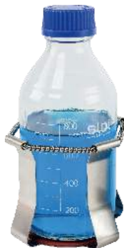
Infusion Bottle Clamp