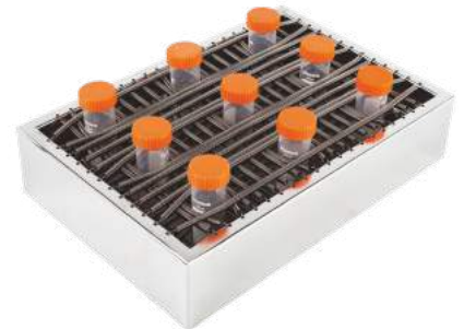
Mini Universal Spring Platform