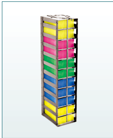
Chest Freezer Rack w/100-Cell Hinged Plastic Storage Box