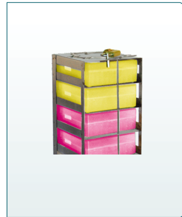
w/DR Lock Device Option