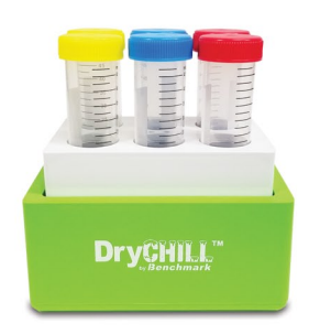
Item: DC0650 6 x 50 ml tubes (29mm)

PO Box 709 Edison, NJ 08817 Ph: 908-769-5555 Fax: 732-313-7007 Web: www.BenchmarkScientific.com Email: Info@BenchmarkScientific.com