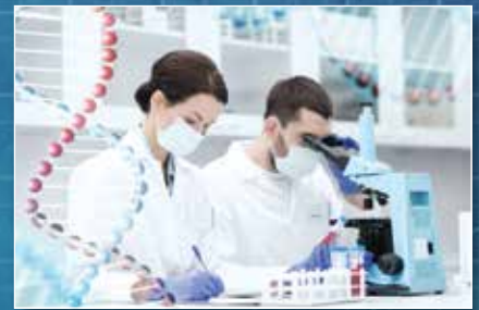
Biology & Bio-Scientific