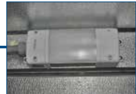
LED interior lighting