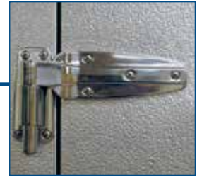
Heavy duty adjustable cam-lift door hinges - one spring loaded