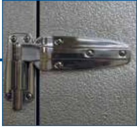
Heavy duty adjustable cam-lift door hinges - one spring loaded (patented)