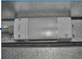
LED interior lighting