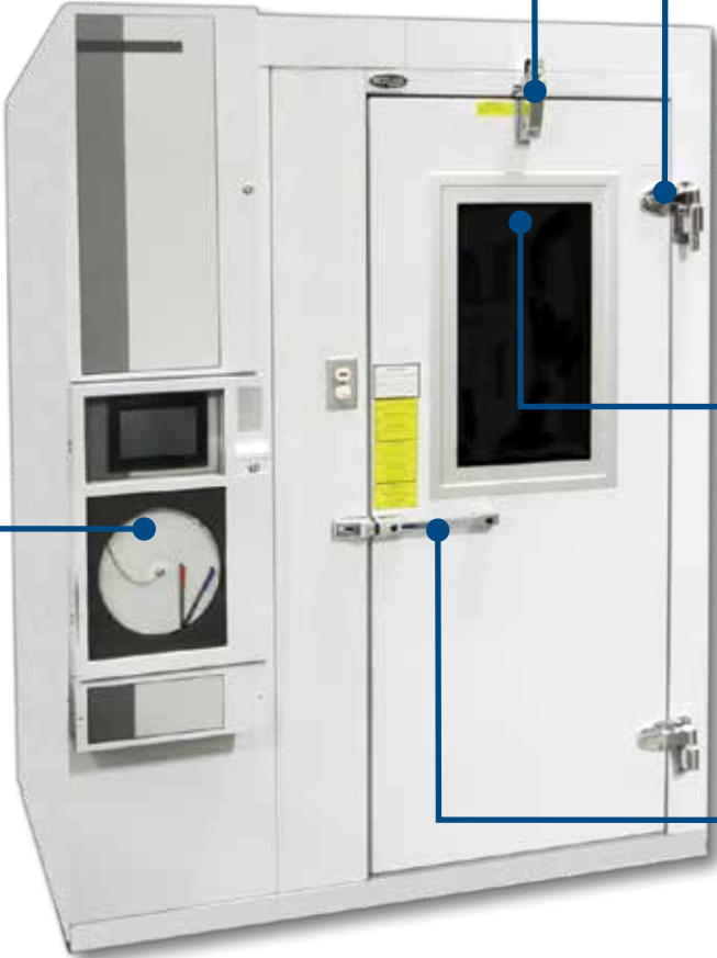
Model shown with custom white exterior.