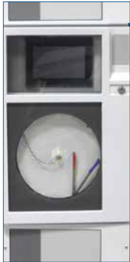
UL approved Control Panel complete with circuit breakers and multi audio visual alarms for added safety