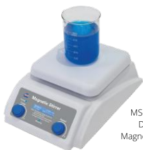
MS-01DUA Digital Magnetic Stirrer