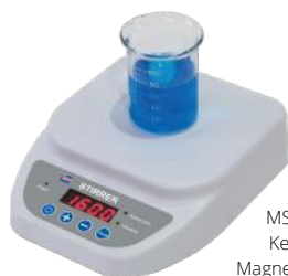
MS-01UA Key-Pad Magnetic Stirrer