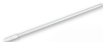
Stir Bar Retriever (MSA-01)