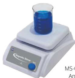
MS-01AUA Analog Magnetic Stirrer