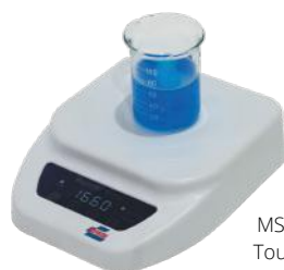
MS-01TUA Touch-Pad Magnetic Stirrer