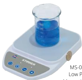
MS-01FUA Low Profile Magnetic Stirrer

An Essential Instrument for every Laboratory for Mixing Solutions